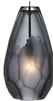
Shown in antique bronze / smoke

Briolette Freejack Pendant features a classic teardrop shaped glass that has been hand finished with unique semi-opaque facets. Compatible for use with 1-circuit Monorail track system or Freejack canopy. Supplied with six feet of field-cutable suspension cable and a Freejack connector. Freejack canopy required if used as a monopoint, sold separately.