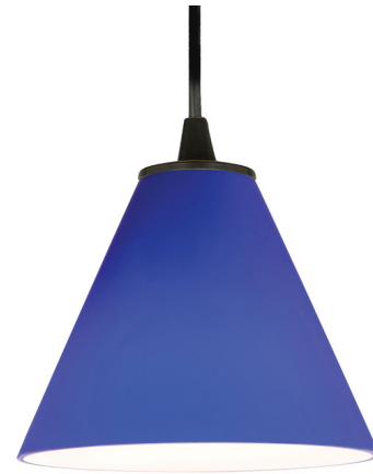
Shown in oil rubbed bronze / cobalt blue

The Martini Cord Pendant brings a simplistic beauty to your interior space. The smooth cone shaped diffuser casts warm shadows of light across your room. Brushed Steel includes a Clear cord and Oil Rubbed Bronze includes a Black cord.