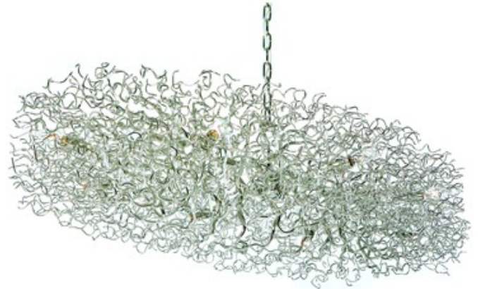
Shown in: Nickel

The Hollywood Oval Chandelier features sculpted metal in an organic design, evocative of bare branched trees. Light reflects off the sinewy branches of this sculptural masterpiece. Each fixture is a unique, hand crafted piece, and comes with a certificate of authenticity. Note: Large and Extra Large versions require a special rated junction box for fixtures weighing over 50 pounds.