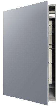
Shown in matte silver / mirror

The Simplicity Medicine Cabinet features exceptional reflectivity. Corrosion resistant DuraMirror glass. Features a mirrored interior, adjustable shelves, and interior 20 Amp, 120V AC duplex receptacle with Type A and C USB charging ports. Available with right or left hinge. Surface mounting kit included. Internal top light controlled by internal PIR sensor. Note: The Simplicity medicine cabinet must be installed in the W x H (width x height) orientation as listed; it cannot be installed in any other direction.