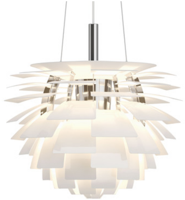
Shown in: White

The PH Artichoke Pendant is an original midcentury icon. Created in 1958 by Danish design genius Poul Henningsen, the PH Artichoke is a glare-free luminaire featuring laser-cut metal leaves, which give it the sharp smooth lines so indicative of modern design. The leaves shield the light source and redirect and reflect the light onto the underlying leaves creating a stunningly unique illumination.