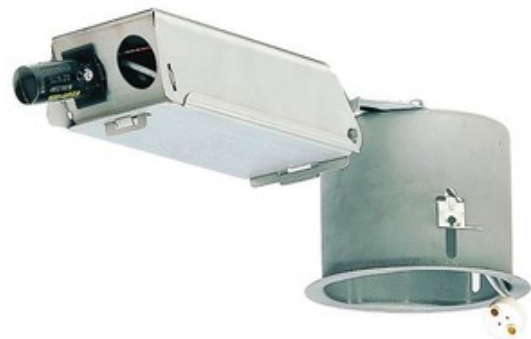
Shown in: Aluminum

Lytepoints 303MRE 3.75 Inch Shallow Non-IC Remodel Frame-Kit Kit is a low profile housing designed for mounting in existing ceilings from below. Non-IC designation requires that insulation be kept a minimum of 3 inches away from housing. Includes 60 watt Class 2 electronic transformer. One 37 watt, 12 volt GX5.3 MR16 halogen lamp is required, but not included. UL listed. Rated for damp or wet location depending on trim option used. 11.4 inch width x 4.25 inch depth x 3.25 inch height. A complete fixture includes a frame-in kit and a trim kit, sold separately.