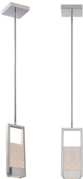
Shown in: Chrome / Piastra

The Swing Pendant features a Chrome finish with Piastra glass and provides both uplight and downlight. One 11 watt 120 volt, 90CRI, 3000K LED module is included. 5 inch width x 12 inch height x 56 inch adjustable length. Includes one 6 inch and three 12 inch downrods. ETL listed for damp locations.