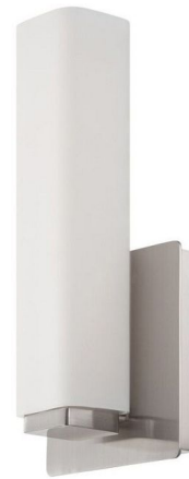
Shown in brushed nickel / opal

The Vogue Wall Sconce features hand-blown etched Opal glass and expertly crafted hardware. Vogue slips into transitional, contemporary, and urban industrial decor plans with ease. Available in two sizes with a Satin Brass, Brushed Nickel, Bronze, or Chrome finish. Three color temperature options available.