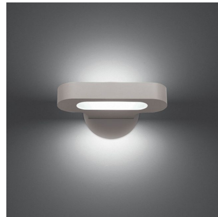
Shown in silver grey

LAMP LIFE . . . . . 50000 hours COLOR RENDERING . . . . . 80 CRI LAMP COLOR . . . . . 3000K LUMENS/WATT . . . . . 68.05 LUMINOUS FLUX . . . . . 1361 lumens