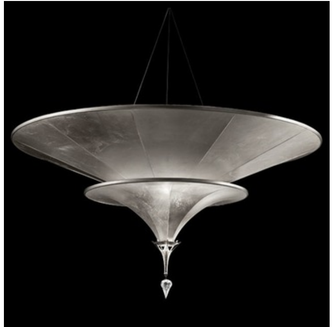
Shown in: Silver Leaf

The Icaro Pendant is inspired by Icarus in Greek Mythology, and his attempt to fly from Crete with wings made of feathers and wax. The Icaro glass fiber form is created from flying to close to the sun which molds the elements together. Note: Overall height is not adjustable and must be specified to order. Minimum / Maximum height: 26 / 95.75 in.