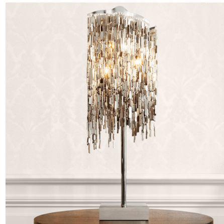
Shown in nickel

The Arthur Table Lamp is inspired by the namesake knight. Light shines through the curtain of metal pieces, in varying lengths hung off the frame, casting glorious shadows across your room. Dimmer switch. Each fixture is a unique, hand crafted piece, and comes with a certificate of authenticity.