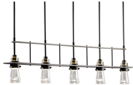
Shown in dark smoke / clear

PRODUCT DIMENSIONS . . . . . Min/Max Adjustable Overall Height: 12.2"-57.2"