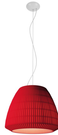
Shown in white / red

The Bell Pendant offers a chic, modern look that will tie seamlessly into a number of spaces, featuring a bell shaped White finished metal frame covered with strips of extra smooth, flame-retardant and acoustic ponge fabric. Equivalent Sound Absorbing Area up to 4.63, allows Bell to reduce the noise as far as 59%.NOTE: Bottom diffuser for 23 5/8 inch pendant sold separately. No diffuser available for 17.75 inch option.