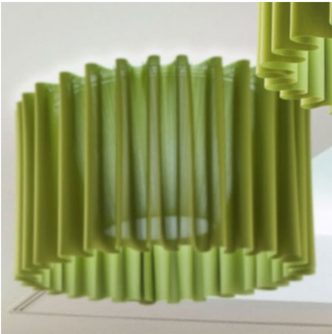
Shown in: White / Light Green

The Skirt Collection takes inspiration from the world of fashion, unsurprisingly, from the garment of the same name. Its elegant and refined design allows Skirt to adapt to different types of environments, from residential to contract and hospitality. The rippled lampshade is composed of a fabric that also has sound-absorbing properties, which allow it to reduce noise by up to 53%, thanks to its Equivalent Absorption Area which reaches a maximum of 3.55. Available with GU24 base (bulbs included) or E26 base (bulbs not included) sockets. Optional outer black mesh shade available.