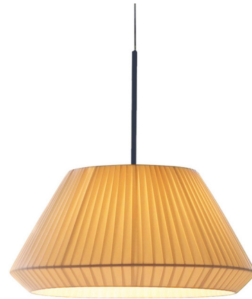
Shown in black / cream translucent ribbon

The Mei 60 Pendant features a translucent shade of hand wrapped polyester blend ribbon in White or Cream with a stem in black finish. Includes frosted injection molded polycarbonate lens.