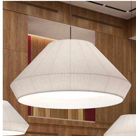
Shown in satin nickel / white translucent ribbon

Mei 150 Pendant features a translucent shade of hand wrapped polyester blend ribbon in White or Cream with a Satin Nickel finish. Includes frosted injection molded polycarbonate lens. Six 100 watt, 120 volt A19 Medium base incandescent bulbs are required, but not included. 59.06 inch diameter x 27.56 inch height x 98.43 inch overall length.