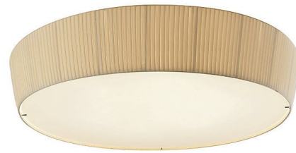
Shown in stainless steel / cream translucent ribbon

Plafonet 03 Ceiling Flush Mount features a hand wrapped White or Cream translucent polyester blend ribbon shade, or a White cotton shade. Finish in Stainless Steel. Includes frosted polycarbonate injection-molded diffuser. Requires six 20 watt 120 volt T4 medium base compact fluorescent lamps, not included. Dimensions: 34.25 inch diameter x 7.87 inch height. UL listed.