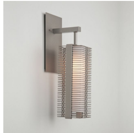
Shown in beige silver / frosted

The Downtown Mesh Hanging Wall Light features a Gilded Brass, Matte Black, Metallic Beige Silver, or Flat Bronze finish with an inner Frosted glass diffuser or without glass. One 60 watt max 120 volt B10 medium base bulb is required, but not included. 5 inch width x 16.1 inch height x 6.4 inch depth. UL listed. Made in the USA.