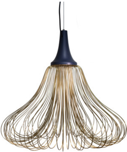
Shown in: Black / Brass

The Whisk Collection is an elegant play of lights, lines and undulating curves. Metal wires are sculpted by hand into various shapes reminiscent of its namesake. Its minimalist and contemporary feel make it a timeless piece to incorporate into any interior setting.