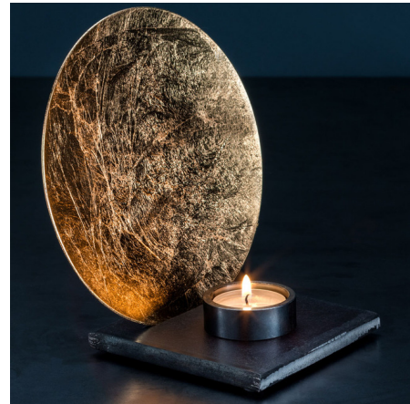
Shown in iron / gold leaf

The Luna Candle Holder consists of a round reflector disc atop a square, iron base. The disc is covered with a metallic leaf material to reflect light from the candle and amplify its warm glow.