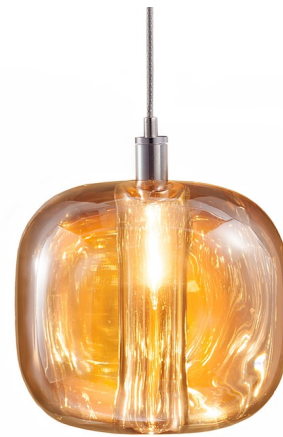
Shown in chrome / amber

The Cubie 1 Light Pendant is available with an Amber, Smoke, or Clear hand-molded crystal shade and a Chrome finish. Special forming and cutting artistry is used to achieve the curvature frame of this drop. A unique cable suspension has been designed and developed by VISO engineers to eliminate the need for aircraft cables. Easy to adjust on site without use of tools. One 20 watt, 12 volt JC type G4 base halogen bulb is required, but not included. ETL listed. 5.5 inch width x 48 inch height.