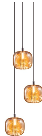
Shown in chrome / amber

COLOR . . . . . Amber BODY FINISH . . . . . Chrome WATTAGE . . . . . 60W DIMMER . . . . . Standard 120V DIMENSIONS . . . . . 106"L x 5.5"W x 48"H BULB NOT INCLUDED . . . . . 3 x JC/G4 (bipin)/20W/12V Halogen COUNTRY OF ORIGIN . . . . . Canada