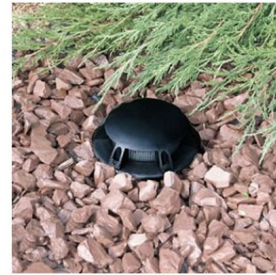
Shown in black / clear

DWCL2 Composite Mini Beacon Fixture is constructed from a single piece compression molded fiberglass reinforced polyester composite material that is textured, pressure formed and molded-in-color in Black. Ribbed clear acrylic optical assembly. Prewired with 3 foot pigtail of 18-2 AWG wire. Low voltage quick connector LVC3 included for easy hook up to the low voltage supply cable not included. One 20 watt T3 bipin halogen lamp included. Lower wattage lamps are acceptable. 5.3 inch diameter x 7.4 inch overall high. Requires remote transformer not included. ETL listed for wet locations.