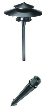
Shown in black / frosted

RL4 12 Volt Aluminum Path Light is fabricated from die cast aluminum with extruded aluminum stem. .50 inch NPS male threads to screw onto mounting accessories, sold separately. Includes S7 mounting stake. Optional junction boxes available, but not required for low voltage fixtures. Thermoset polyester powdercoat finish in Bronze, Black or Verde. Frosted tempered glass lens. Spun aluminum reflector with white thermoset powdercoat. One 20 watt 12 volt JC G4 halogen lamp is included with fixture. Pre-wired with 3 foot pigtail of 18-2 AWG wire. Includes low voltage quick connector LVC3 for easy hook up to the low voltage supply cable not included. 10 inch width x 17.25 inch height. ETL listed for wet locations. Required remote transformer sold separately.