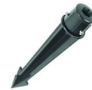
Shown in black / frosted