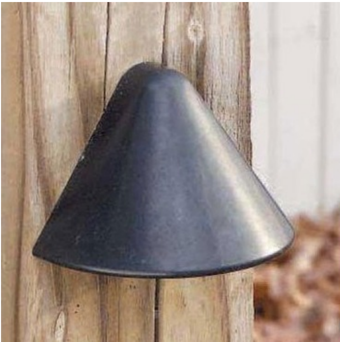
Shown in: Black

SRL4 Aluminum Wall Mount Decklyte is fabricated from die-cast aluminum with thermoset polyester powdercoat finish in Black, White, Verde or Bronze. Includes one 10 watt T3.25 wedge base xenon lamp. Pre-wired with a 6 foot pigtail of 18-2 AWG wire. Includes low voltage quick connector LVC3 for easy hook up to the low voltage supply cable not included. 3.5 inches wide x 2.4 inches high x 2 inches deep. ETL listed for wet locations. Requires remote transformer not included.