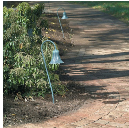
Shown in verde

TUL1 Aluminum Pathlyte with S7 Stake is fabricated from a single piece cast aluminum with stem in extruded aluminum. .50 inch NPS male threads to screw onto mounting stake (included) or junction box (sold separately). Optional junction boxes available, but not required with low voltage fixtures. Thermoset polyester powdercoat finish in Verde. One 12 volt S8 single contact bayonet base lamp (27W max) included with fixture. Pre-wired with 3 foot pigtail of 18-2 AWG wire. Includes low voltage quick connector LVC3 for easy hook up to the low voltage supply cable, not included. Note: Requires low voltage remote transformer, sold separately.