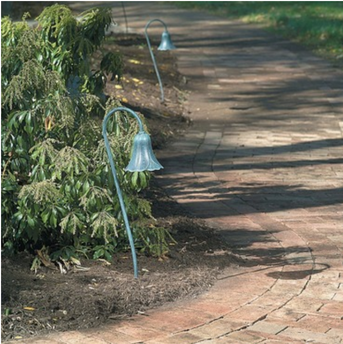
Shown in: Verde

TUL1 Aluminum Pathlyte with S7 Stake is fabricated from a single piece cast aluminum with stem in extruded aluminum. .50 inch NPS male threads to screw onto mounting stake (included) or junction box (sold separately). Optional junction boxes available, but not required with low voltage fixtures. Thermoset polyester powdercoat finish in Verde. One 12 volt S8 single contact bayonet base lamp (27W max) included with fixture. Pre-wired with 3 foot pigtail of 18-2 AWG wire. Includes low voltage quick connector LVC3 for easy hook up to the low voltage supply cable, not included. Note: Requires low voltage remote transformer, sold separately.