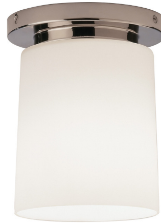
Shown in polished nickel / frosted

The Nina Flush Mount will enhance the ambiance of any space with its cased glass shade and sleek metal canopy. Nina's cylindrical silhouette will effortlessly blend into a modern dining room or hallway. UL listed for Damp locations.