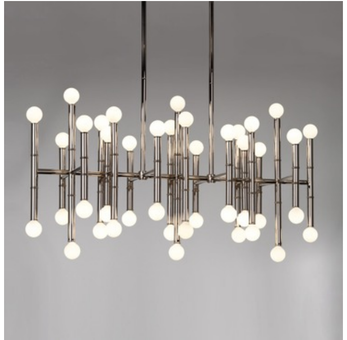
Shown in: Polished Nickel

Meurice Rectangular Chandelier is a sleek bold piece, perfect in any room of your home. Available with a Polished Nickel, Deep Patina Bronze, or Modern Brass finish. Includes 12 feet of cord, two 6 inch downrods, and six 12 inch downrods to customize length.