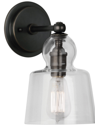
Shown in deep patina bronze / clear

The Albert Wall Sconce is a sleek piece, perfect in any room of your home. The bell-shaped, clear glass shade adds a sophisticated touch to any interior. On/off switch located on backplate.