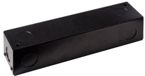
Shown in: Black

The PSB-60W-ELV-24VDC Class 2 LED Power Supply accepts input voltage of 120 volts AC and outputs 24 volts DC power up to 60 watts. Features short circuit and overload protection. The aluminum enclosure allows electrical connections to be made inside the box. Knockouts are provided for use with .50 inch conduit. Power Input: 120VAC, 60Hz. Power Output: Class 2, 24VDC, 2.5A, 60 watts maximum. For indoor applications only. To avoid overheating the power supply, install it in a ventilated remote location where air flows. Maintain proper spacing among power supplies when multiple power supplies are installed in the same remote location. Dimmable with an electronic low voltage dimmer: (Lutron Diva DVELV-300P, Lutron Skylark SELV-300P, or Lutron Maestro MAELV-600), sold separately. ETL listed.