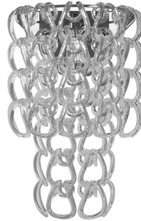
Shown in chrome / transparent

Originally conceived in 1967 by Angelo Mangiarotti, the Giogali Wall Sconce derives both its name and shape from the Italian word giogher , referring to the rope used to tie a horse or ox-driven cart to the yoke. The sconce is composed of a multitude of small, rope-like crystal hooks, which are linked together to form a net of glistening glass. The crystal is draped around the sconce in strands, obscuring the light source and creating a gleaming cascade of light. With its delicate and glamorous aesthetic, Giogali will enhance any interior with an elegant sparkle.