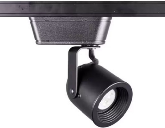
Shown in: Black

808 Low Voltage LED Track Head offers style for a multitude of lighting applications. Features a swivel yoke for easy aiming, 350 degree horizontal rotation and 90 degree vertical tilt, and a mesh back vent for heat dissipation. Integral electronic transformer. Clear lens included. Dims to 10 percent with low voltage electronic dimmer, sold separately. Choice of H, J, or L Track System compatibility. Compatibility: L: WAC L Series and Lightolier Lytespan 120 volt single circuit track (Lightolier track by others) J: WAC J Series single circuit track and Juno 120 volt single circuit and two circuit track systems H: WAC H Series and Halo 120 volt single circuit line voltage track system (Halo track by others)