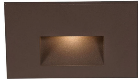
Shown in bronze on aluminum

The 120V Horizontal Scoop Step and Wall Light features a sleek profile with no visible hardware, designed to seamlessly blend into any architecture. These luminaires offer enhanced energy efficient functionality and optimized light output to adequately illuminate stairs, walls and walkways with little or no glare. Made of solid die cast brass in Bronze, corrosion resistant aluminum alloy in a variety of finishes, or 316 marine grade Stainless Steel. Note: Brushed Nickel finish for indoor use only. 120 volt direct wiring with no driver needed. Fits into 2 x 4 junction box with minimum inside dimension of 3 inch length x 2 inch width x 2 inch depth. Includes bracket for J-Box mount. Up to 200 fixtures can be connected in parallel. ELV dimming 100-10%. Note: Bronze on Brass not available in Red or Blue.