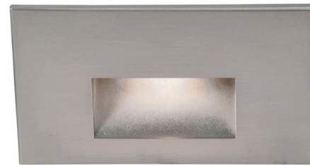
Shown in stainless steel

The 120V Horizontal Scoop Step and Wall Light features a sleek profile with no visible hardware, designed to seamlessly blend into any architecture. These luminaires offer enhanced energy efficient functionality and optimized light output to adequately illuminate stairs, walls and walkways with little or no glare. Made of solid die cast brass in Bronze, corrosion resistant aluminum alloy in a variety of finishes, or 316 marine grade Stainless Steel. Note: Brushed Nickel finish for indoor use only. 120 volt direct wiring with no driver needed. Fits into 2 x 4 junction box with minimum inside dimension of 3 inch length x 2 inch width x 2 inch depth. Includes bracket for J-Box mount. Up to 200 fixtures can be connected in parallel. ELV dimming 100-10%. Note: Bronze on Brass not available in Red or Blue.