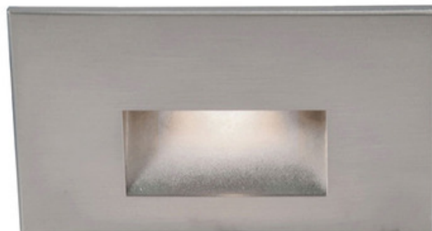
Shown in: Stainless Steel

The 120V Horizontal Scoop Step and Wall Light features a sleek profile with no visible hardware, designed to seamlessly blend into any architecture. These luminaires offer enhanced energy efficient functionality and optimized light output to adequately illuminate stairs, walls and walkways with little or no glare. Made of solid die cast brass in Bronze, corrosion resistant aluminum alloy in a variety of finishes, or 316 marine grade Stainless Steel. Note: Brushed Nickel finish for indoor use only. 120 volt direct wiring with no driver needed. Fits into 2 x 4 junction box with minimum inside dimension of 3 inch length x 2 inch width x 2 inch depth. Includes bracket for J-Box mount. Up to 200 fixtures can be connected in parallel. ELV dimming 100-10%. Note: Bronze on Brass not available in Red or Blue.