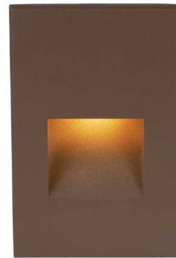
Shown in bronze

COLOR RENDERING . . . . . 85 CRI LAMP COLOR . . . . . 3000K LUMENS/WATT . . . . . 7.44 LUMINOUS FLUX . . . . . 29 lumens