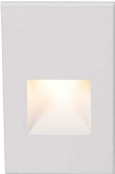
Shown in: White

120V LED200 Vertical Step / Wall Light features a sleek profile with no visible hardware, designed to seamlessly blend into any architecture. These luminaires offer enhanced energy efficient functionality and optimized light output to adequately illuminate stairs, walls and walkways with little or no glare. Direct wiring, no driver needed. Up to 200 fixtures can be connected in parallel. Fits into 2 X 4 junction box with minimum inside dimensions of 3 inch x 2 inch x 2 inch high. Includes bracket for j-box mount. ETL listed. IP66 rated. Title 24 compliant at 120V only. Die cast aluminum in White, Black, Bronze, Graphite, or Brushed Nickel, or marine grade Stainless Steel. Brushed Nickel finish for interior use only.