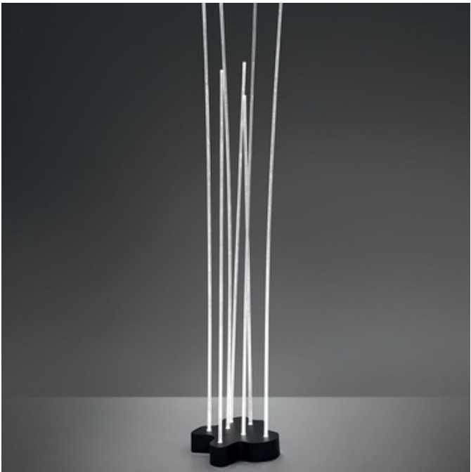
Shown in: Anthracite Grey

Reeds Outdoor Floor Lamp features high performance monochromatic LED modules. Light is diffused through PMMA rods with differing heights to give the impression of a grove of reeds. The base is constructed with transparent polycarbonate casing installed between 2 stainless steel plates. A silicone gasket ensures the fixture is water-tight. The fixture can be fastened to the floor to prevent tipping during high winds. Technopolymer aesthetic cover with an Anthracite Grey finish. Integrated ballast included. Available in two sizes. UL Listed. IP67 Rated. Suitable for wet locations. May be used indoors or outdoors.