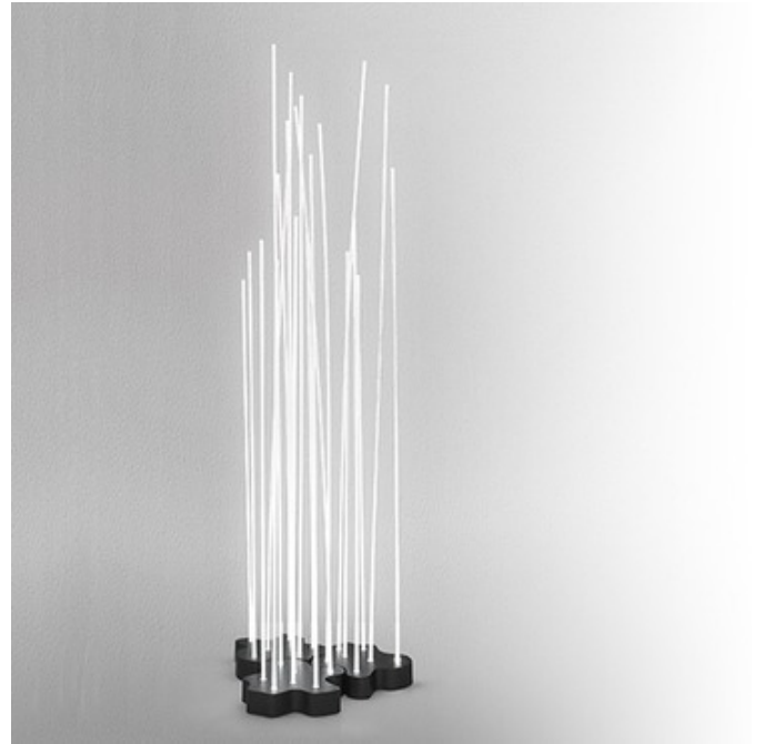
Shown in: Anthracite Grey

Reeds Outdoor Floor Lamp features high performance monochromatic LED modules. Light is diffused through PMMA rods with differing heights to give the impression of a grove of reeds. The base is constructed with transparent polycarbonate casing installed between 2 stainless steel plates. A silicone gasket ensures the fixture is water-tight. The fixture can be fastened to the floor to prevent tipping during high winds. Technopolymer aesthetic cover with an Anthracite Grey finish. Integrated ballast included. Available in two sizes. UL Listed. IP67 Rated. Suitable for wet locations. May be used indoors or outdoors.