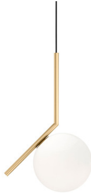
Shown in: Brass / Opal

The IC Pendant, designed by Michael Anastassiades for Flos, features diffused light with an Opal glass diffuser and a Chrome, Red Burgundy, Black, or Brass finish. Available in two sizes. Canopy diameter: 4.3 inch. UL listed.