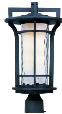
Shown in black oxide / water glass

Oakville Outdoor Post Light is a bold contemporary piece, perfect in any exterior space. Water glass surrounds an opal diffuser and is complemented by die cast aluminum finished in Black Oxide. Note: Post sold separately.