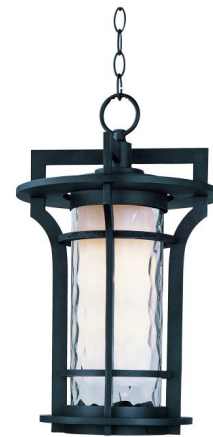
Shown in black oxide / water glass

Oakville Outdoor Pendant is a bold contemporary piece, perfect in any exterior space. Water glass surrounds an opal diffuser and is complimented by die cast aluminum finished in Black Oxide. Comes with 3 feet of chain to customize length. Title 24 compliant. Damp location rated. UL listed.