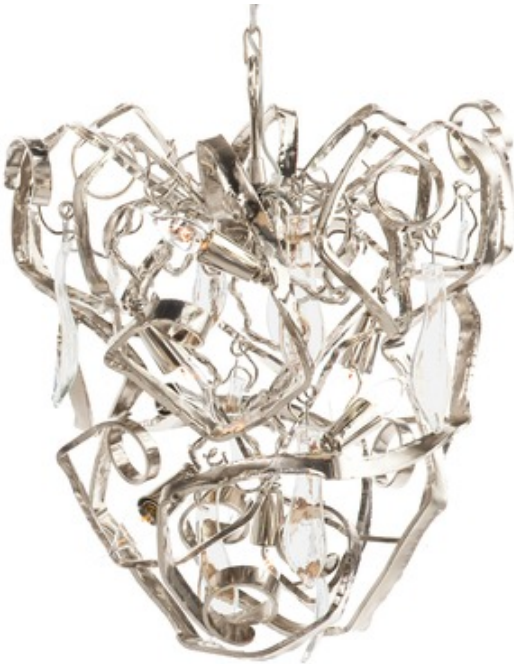
Shown in: Nickel / Clear

The Delphinium Conical Chandelier features a diffuser of hand-sculpted metal full of gaiety and elegance. Large, clear glass elements drop down throughout the garland of iron completing this sculptural masterpiece. Includes a 6.29 inch ceiling cover plate. Note: Largest size requires a special rated junction box for fixtures weighing over 50 pounds.