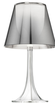
Shown in silver