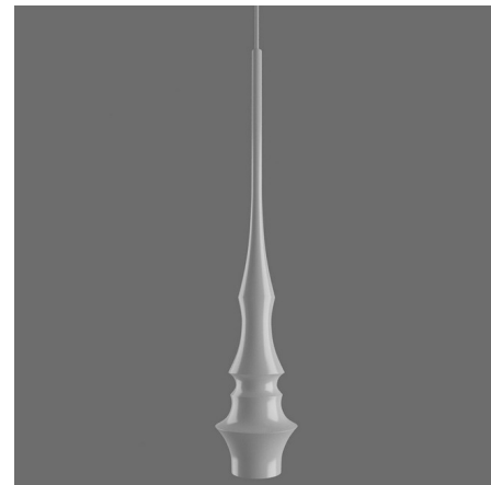
Shown in matte white

The Slend 02 Pendant shows off an elegant sculptural silhouette constructed out of aluminum and iron. It is versatile enough to work in many spaces, whether hung as a single light in a small powder room or arranged as a series of varying hanging heights for a dramatic, modern effect in a seating area or over a bar.