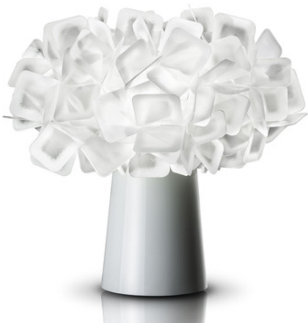
Shown in: White

The Clizia series, which consists of colored interlocked squares in Opalflex assembled manually, evokes the story of the mythological nymph who, repudiated by the Sun, becomes Elitropio. This range, fruit of operative hands that shape the techno polymer as if it were smooth silk, expands with an unusual and striking table version (consisting of 230 squares in Lentiflex supported by a colored base). Clizia Table Lamp features numerous squares of Opalflex clustered into an intricate weave of texture and style in White, Black, Orange, Fume or Purple finishes. Product is magnetic, allowing easy removal for cleaning.