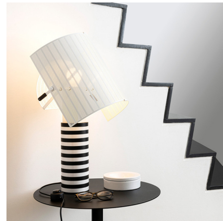
Shown in black / white

Part of the esteemed Artemide masterpieces collection, the Shogun Table Lamp is an iconic work of contemporary design, proudly featured in renowned institutions like the Metropolitan Museum of Art in New York. Originally conceived in 1986, Shogun has been thoughtfully updated to incorporate modern LED technology, blending timeless artistry with current efficiency. Shogun creates a powerful graphic presence through its striking contrast of light and shadow. The distinctive diffuser is meticulously crafted from perforated steel, which ingeniously filters light through tiny holes, projecting an intriguing pattern of light and shadow onto surrounding surfaces. This unique visual effect adds depth and drama to any room. The innovative steel shade can be easily adjusted, allowing you to direct light precisely where it's desired, providing both functional illumination and a dynamic artistic element. The Shogun Table Lamp is a stunning addition to any modern interior, serving as both a celebrated design object and a captivating light source.