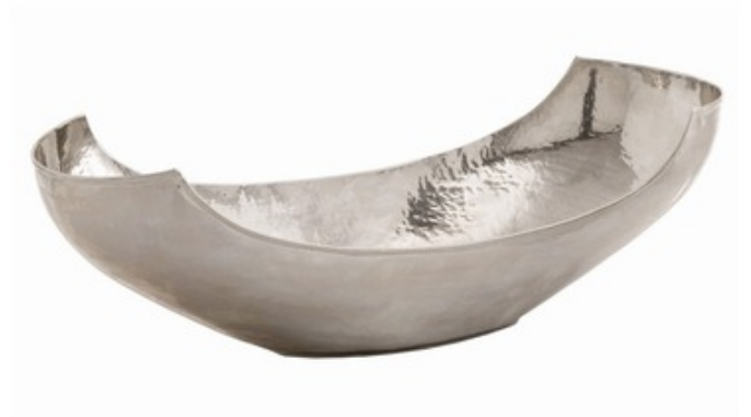
Shown in: Polished Nickel

Swain boat shaped hammered brass bowl in Polished Nickel becomes a centerpiece or sculptural piece. 18.5 inch width x 7 inch depth x 6 inch height.