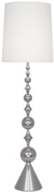
Shown in: Polished Nickel / Oyster Linen

The Harlequin Floor Lamp features an Oyster Linen shade with a Polished Nickel or Polished Brass finish. Comes with 12 feet of cord and switch on the socket. One 150 watt, 10 volt A19 3-Way type Medium base incandescent bulb is required, but not included. 18 inch width x 65.75 inch height.