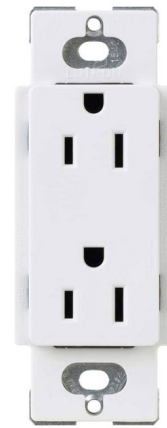
Shown in gloss white

15 Amp Duplex Receptacle is compatible with loads up to 15 amps and 125 volts. Available in satin and gloss finishes. NOTE: Designer wall plates sold separately.