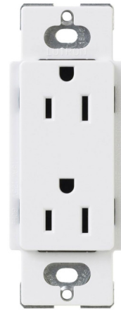
Shown in gloss white

The Claro 15A Tamper Resistant Receptacle features a tamper resistant shutter mechanism. For use with 120 volt systems up to 15 amps. Available in gloss and satin colors. NOTE: Designer wall plate sold separately.